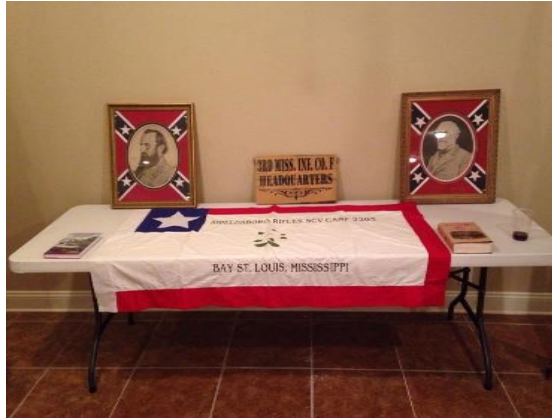
The table with Generals Lee & Jackson photos at the Mercy House at Lakeshore Baptist Church.