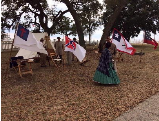
Camp #2263 Members and Associates set up at Beauvoir for the first 3 rd Saturday Living History on Jan. 20, 2018.