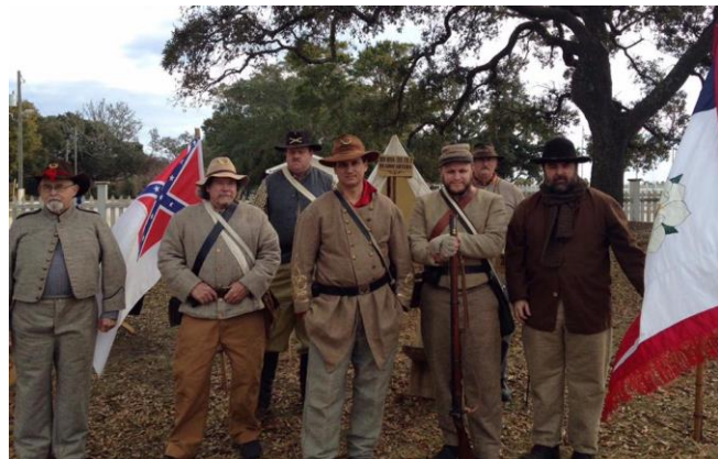
Members and Friends of the 3 rd Miss. Inf. Co. F, Shieldsboro Rifles pose for a photo between educating visitors..